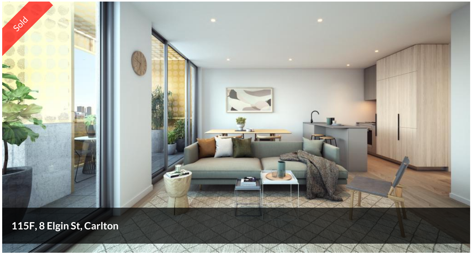
115F, 8 Elgin St, Carlton